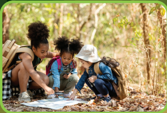
Meet new friends!

Visit An Elephant Sanctuary! Jeep Safari In Chitwan National Park! Interactive Classes With Wild Elephants!