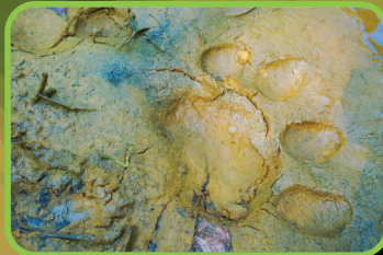
Learn new communication skills!