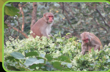
Communicate with wild animals!