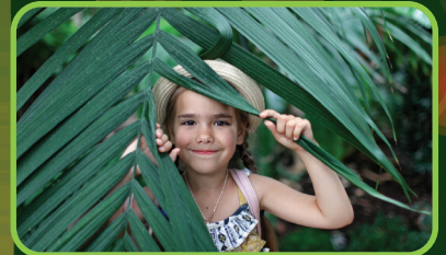
Communicate with all beings of nature!

The Chitwan district is located in Southern Nepal approximately 155 Kilometers from Kathmandu. Chitwan National Park is a rich natural area in the Terai, the subtropical southern part of Nepal. A total of 68 species of mammals, 544 species of birds, 56 species of herpetofauna and 126 species of fish have been recorded in the park. The park is especially renowned for its protection of One Horned Rhinoceros, Royal Bengal Tiger and Gharial Crocodile.